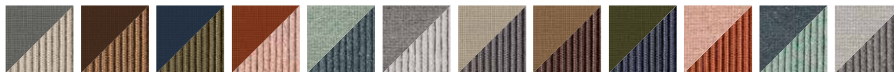
Grey+Sand Brown+Tobacco Blue+Olive Orange+Rose Mint+Teal Stone+Clay Sand+Grey Tobacco+Brown Olive+Blue Rose+Orange Teal+Mint Clay+Stone