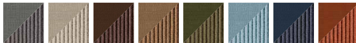
Grey Sand Brown Tobacco Olive Sky Blue Orange