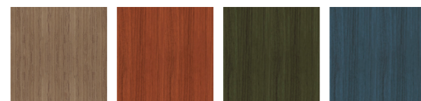
Iroko Iroko Orange Iroko Green Iroko Blue