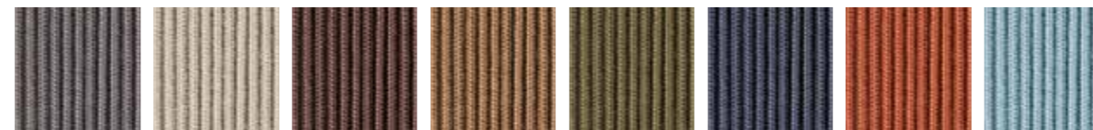
Grey Sand Brown Tobacco Olive Blue Orange Sky