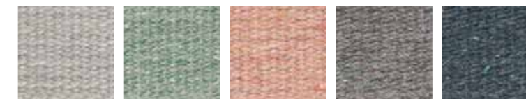
Clay Mint Rose Stone Teal