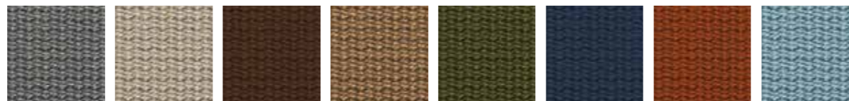
Grey Sand Brown Tobacco Olive Blue Orange Sky