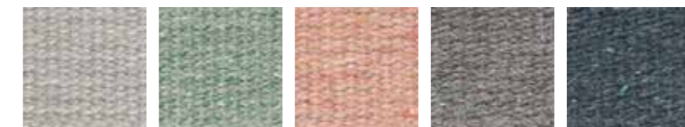
Clay Mint Rose Stone Teal