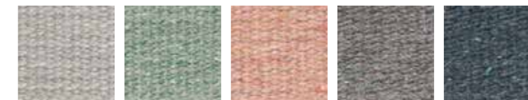
Clay Mint Rose Stone Teal